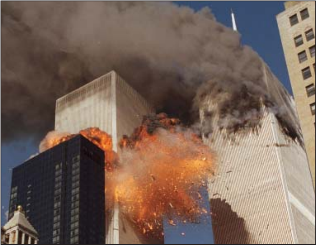
More 9-11s to come? America's criminally lax immigration and visa policies gave the terrorists free access to target our citizens. Those policies still have not been fixed.